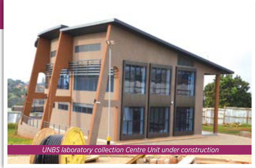
UNBS laboratory collection Centre Unit under construction

The pioneer of e-services was the Laboratory Information Management Systems (LIMS). With LIMS, once a sample is received it is put in our system which allows faster release of results than the manual system. The only part we can’t automate is at the point of receiving the sample, because there you have to check that the sample is physical, the integrity, the adequacy and the proper packaging. Then it is entered into the system. All the approvals, and assessments are done online. And this has helped us cut back turnaround time by 40%. It used to take us 30 days to get results, but now it takes less than 20 days. But our target is 15 days once we add new equipment and stuff at the new premises. The minimum we can push the results would be 7 days. So it depends there samples which take one or two days and those which take 28 days like cement.