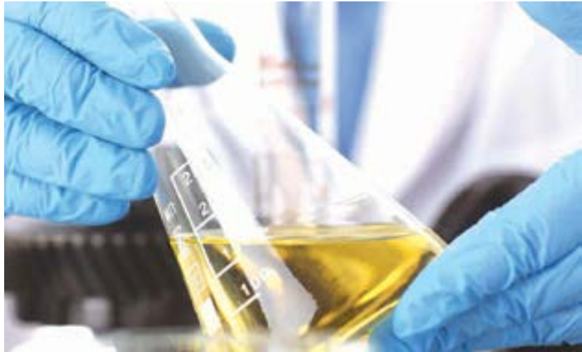
Fuel sample undergoing a Qualitative test.