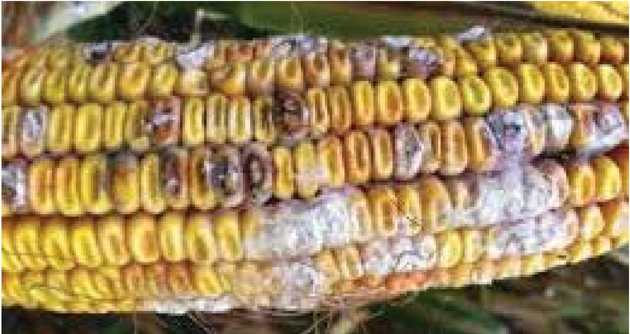
Grain affected by mould that produce aflotoxins