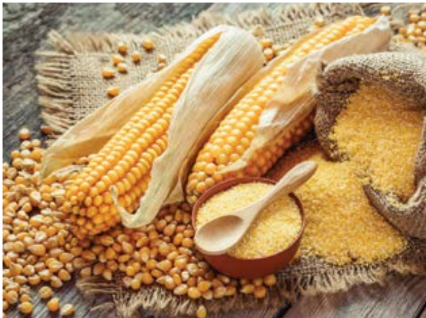
Well stored and healthy grain.